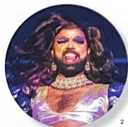
1. View of "Paraventi: Folding Screens from the 17th to the 21st Centuries," 2023–24, Fondazione Prada, Milan. Foreground: Cy Twombly, Paravent , 1989. 2. KaMani Sutra performing at "Dragistan," Ice Palace, Cherry Grove, Fire Island, NY, July 30, 2023. 3. Jim Hodges, Craig's Closet , 2023, granite, bronze. Installation view, New York City AIDS Memorial Park. 4. Lisha Bai, George's Window , 2023, linen, ramie fabric, 96 1/2 x 49 1/2". 5. Prada Womenswear Spring/Summer 2024 runway show, September 21, 2023, Milan.